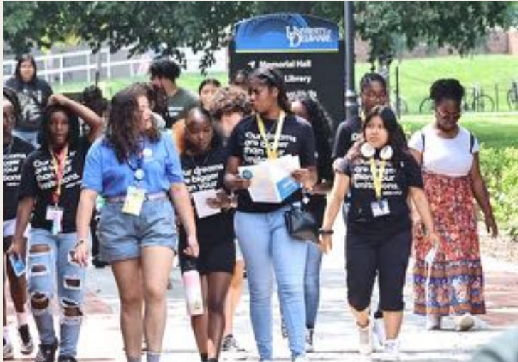
COHORT 10 SCHOLARS TOURED CAMPUS AT THE UNIVERSITY OF DELAWARE