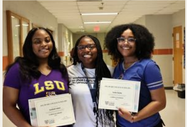
DCS GRADUATED ANOTHER INSPIRING COHORT OF SCHOLARS THIS SUMMER!