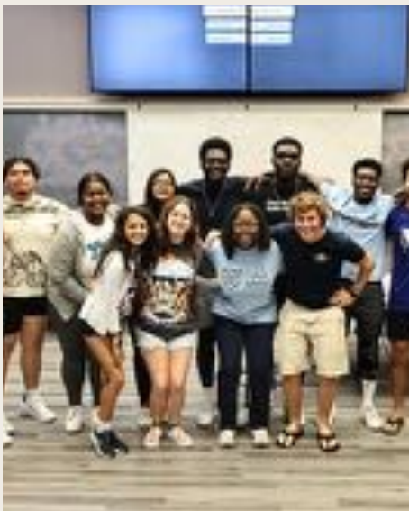
SPECIAL THANKS TO OUR STUDENT ADVISORS WHO MADE THE 2023 SUMMER PROGRAM SUCH A SUCCESS!